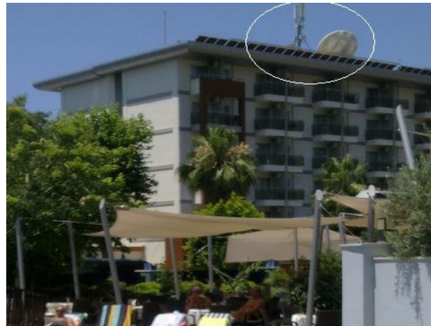
Figure 1. GSM antenna installed on hotel premises

electromagnetic fields and their effect on the environment" [28].