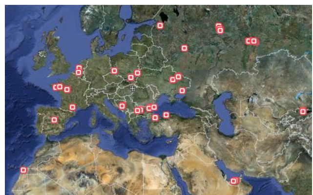
Figure 3. GSM antenna locations

In official international organisations reports magnetic field density or EMF should not exceed a limit value of 1000 mG for general and limit of 5000 mG or 500 \mu\text{T} (for occupational areas [11], [21], [22], [23]. Research results show that the human body should not be exposed to this high levels of EMF [11], [14]. This is becoming important because in home and working environment there is real potential risk of creating points “hot spots” where EMF exceed acceptable level values [8], [11], [14]). Computer devices together with other electrical devices in close proximity together can produce greater values than stated above creating “host spots” [29]. One of the previous research task was to contribute and promote idea that GSM base station has to be mapped than their EMF has to be measure [29] using wikimapia category “base tranceiver / GSM station”. In January 2011 there were 23 mapped antennas and on 1 st of July 2011 there were total 64 mapped GSM base station world wide – Figure 3.